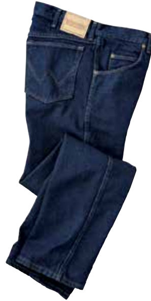
Wrangler® Classic Fit Jeans 5521