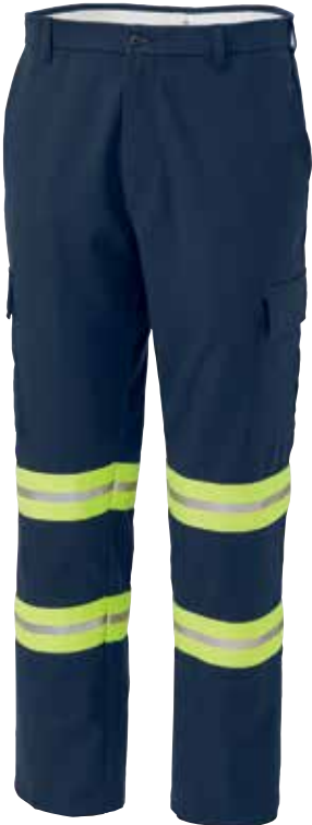
Aramark Enhanced Visibility Cargo Work Pants 2916