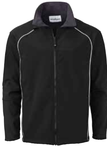
WearGuard® System 365® FusionTec™ Jacket 82006