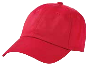
WearGuard® Lightweight Low- Profile Cap 1697