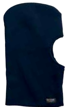
WearGuard® Knit Face Mask 920