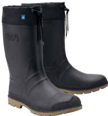
Kamik Workday2 Waterproof Steel Toe Boots