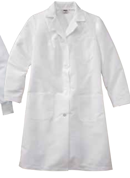
Aramark Women's Tech-Lab Coat 382