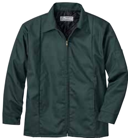
Aramark Industrial Panel-Front Jacket 305