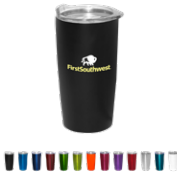
20 OZ. Emperor Vacuum Tumbler MG685