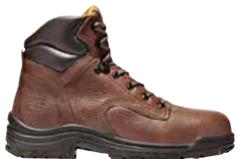
Timberland® PRO™ TITAN® 6" Alloy-Toe Work Boots