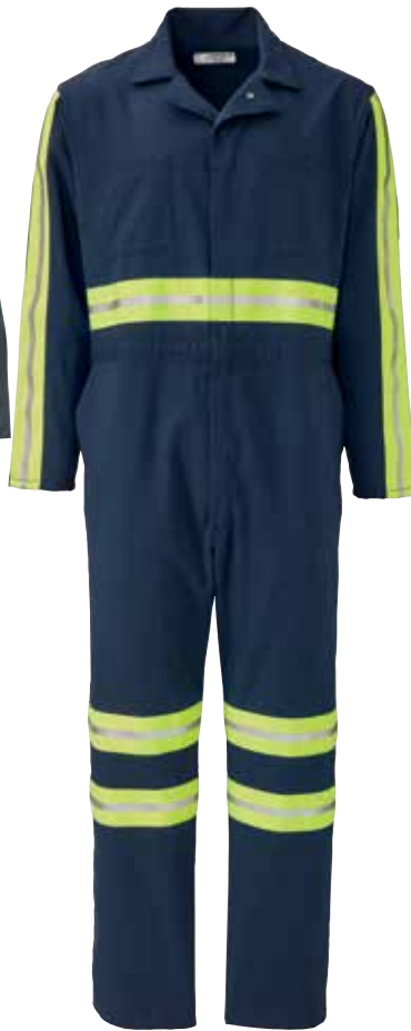
Aramark Enhanced Visibility Coverall 2917