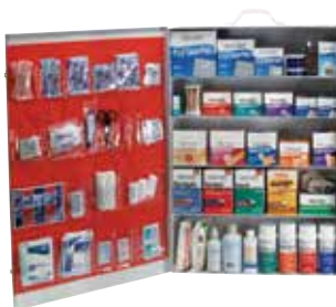
First Aid Kits