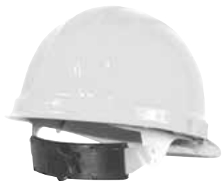
Ratcheting Rain Brim Hard Hat 7526