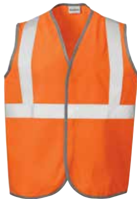
WearGuard® Class 2 High-Visibility Vest 1075