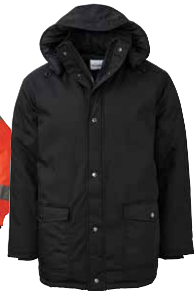
WearGuard® 4-Layer Parka 82405