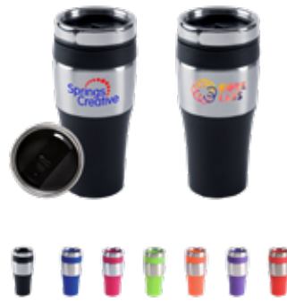
16 OZ. Silver Streak Tumbler MG410