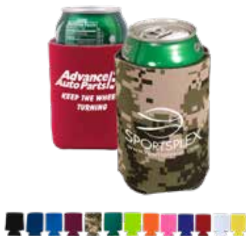
Folding Can Cooler Sleeve CH100