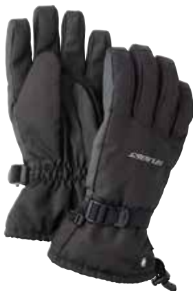
Seirus Premium 6-Layer Glove