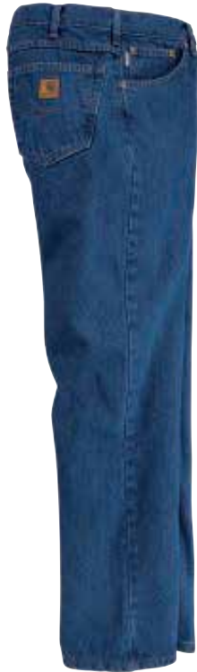
Carhartt® Relaxed-Fit Jeans 5508