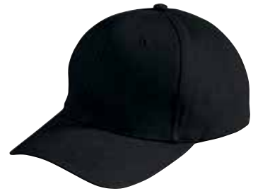
WearGuard® Brushed Cotton Cap 1640