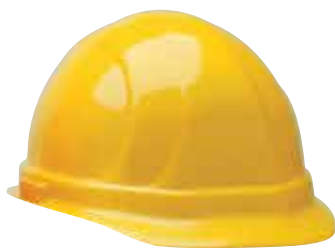
Hard Hat 7530