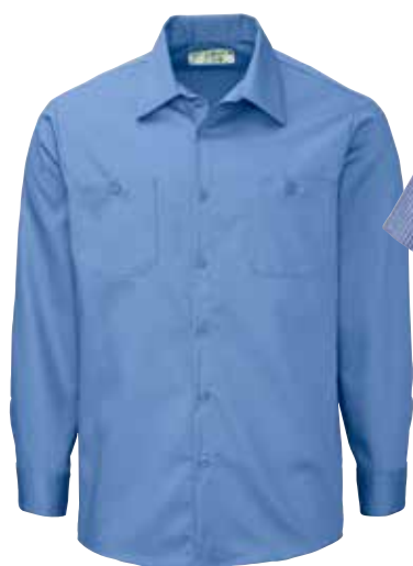
Aramark Authentic™ Long-Sleeve 100% Cotton Shirt 1221