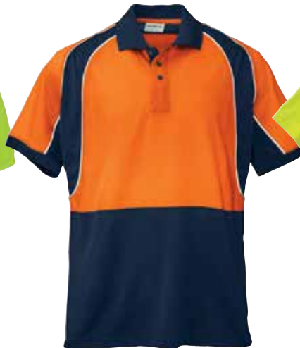
WearGuard® Enhanced-Visibility Knit Polo