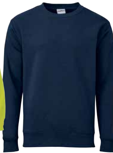
WearGuard® WearTuff™ Low-Shrink Sweatshirt 1285