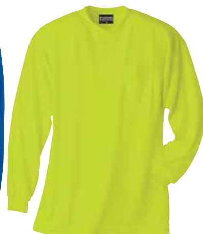
WearGuard® Enhanced- Visibility Long-Sleeve T-Shirt 690