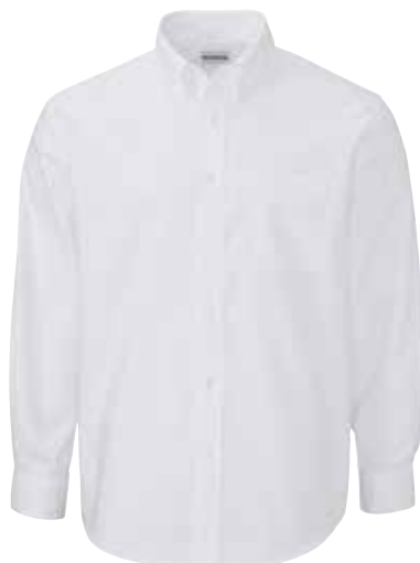
WearGuard® Ultimate Men's Long-Sleeve Oxford Work Shirt 1400