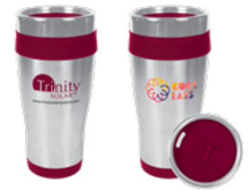
16 OZ. Blue Monday Travel Tumbler MG708