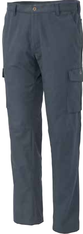
SteelGuard® Cargo Pants 21215