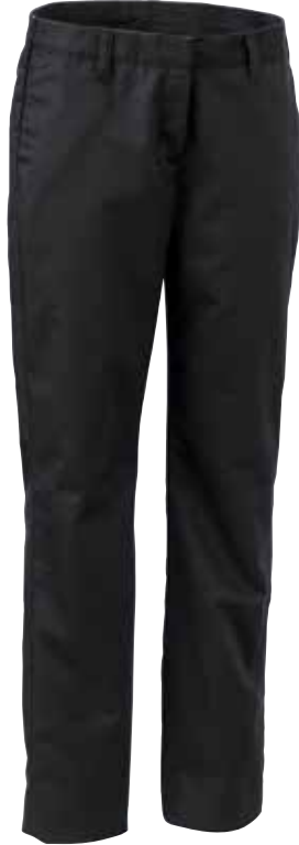
Aramark Women's Flat-Front Work Pants 236