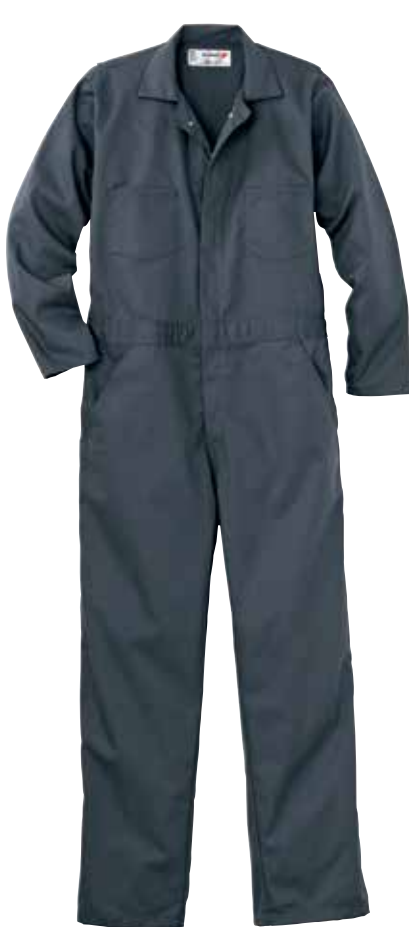
Aramark Heavy-Duty Twill Coveralls 316