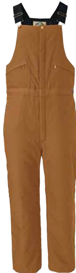
SteelGuard® Insulated Overalls 3357