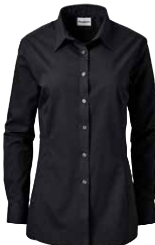
WearGuard® Women's Long- Sleeve Poplin Shirt 14082