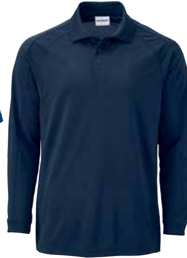
WearGuard® Men's Long-Sleeve Premium Performance Piqué Polo