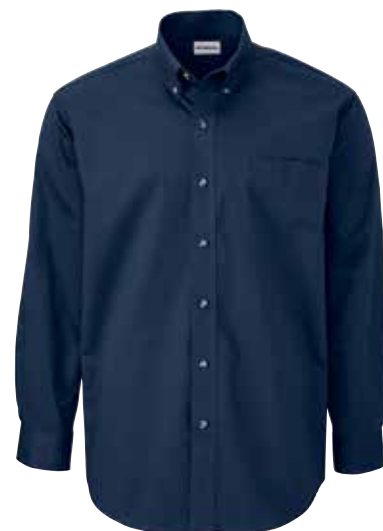
WearGuard® Men's Long-Sleeve Fine Line Blended Twill Shirt 3544