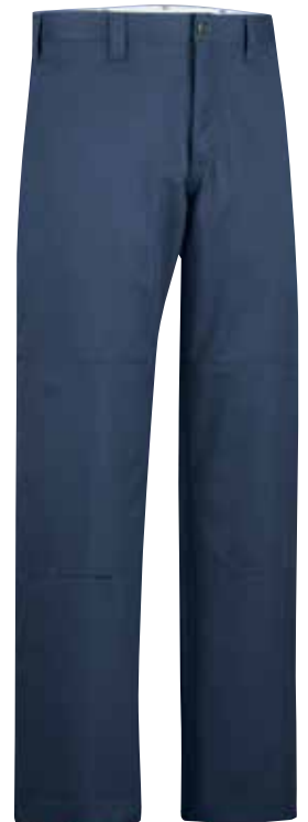
Dickies® Double-Knee Industrial Work Pants 9796