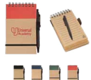
Pocket Eco-Note Jotter PL-3756