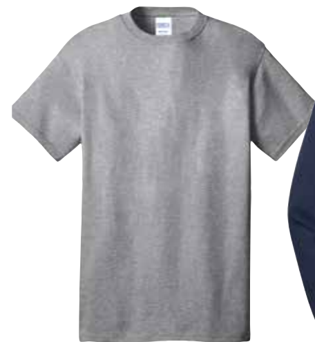
Cotton Short-Sleeve No Pocket T-Shirt PC5400

Establish professionalism with your customers, improve employee morale and boost your brand identity with crisp uniforms