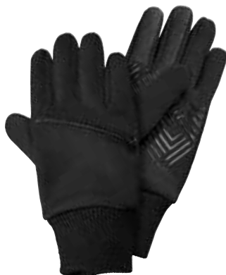
Stretch-Knit Tech Gloves