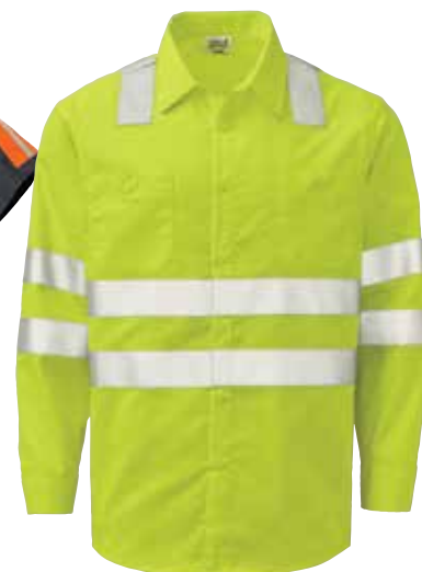
Aramark Class 3 Long-Sleeve Work Shirt 3274