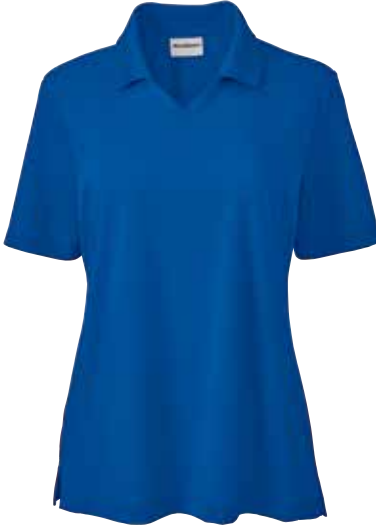
WearGuard® Women's Premium Performance Piqué Polo