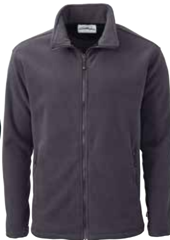
WearGuard® System 365® Water-Repellent Microfleece Jacket 2943