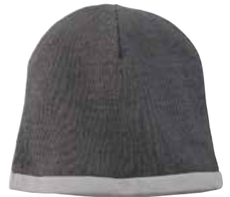
Sport-Tek® Performance Knit Hat 7039