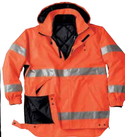
WearGuard® Class 3 High- Visibility Waterproof System Parka 16797