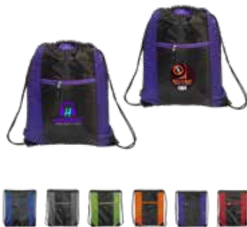
Porter Collection 210d Polyester And Mesh-Patterned Drawstring Bag LT-3945