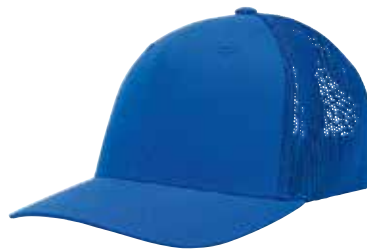
Flexfit® Trucker Cap 16511