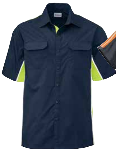
WearGuard® Enhanced- Visibility Short-Sleeve Color Block Work Shirt 2094