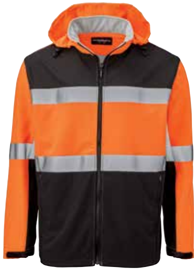
WearGuard Class 2 Color Block Bonded Jacket 416

Establish professionalism with your customers, improve employee morale and boost your brand identity with crisp uniforms