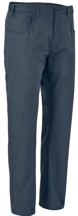
Aramark Jean-Style Industrial Work Pants 221