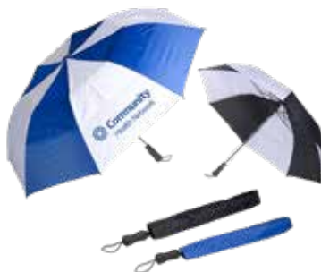
Vented Auto Open Golf Umbrella OD215