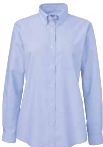
WearGuard® Ultimate Women's Long-Sleeve Oxford Work Shirt 1405