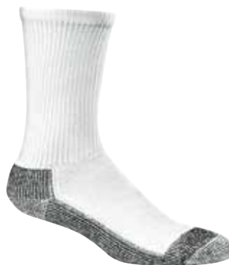
Steel-Toe Work Socks