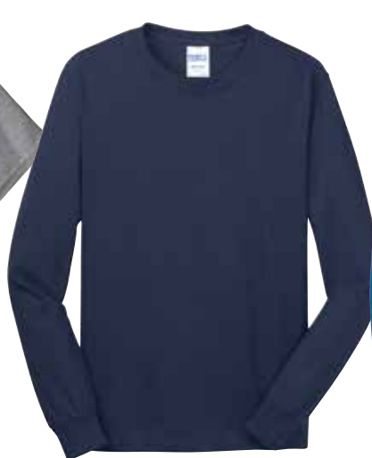
Long-Sleeve Cotton T-Shirt PC5401