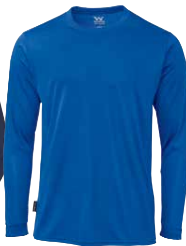
WearGuard® TecGuard™ Long- Sleeve Jersey Knit Crewneck 31137