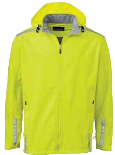
WearGuard® System 365® Lightweight Soft-Shell Jacket 82010