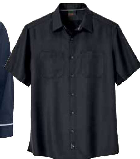
Aramark FlexFit™ Men's Short- Sleeve Performance Work Shirt 12472