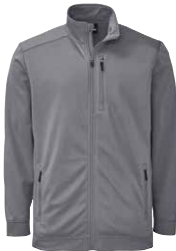
WearGuard® Performance Jacket 3442