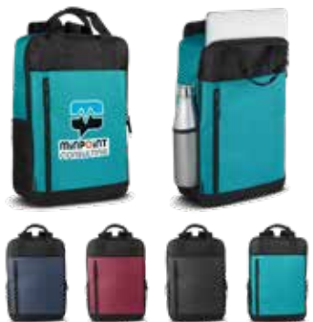
Austin Nylon Collection-Laptop Backpack BG360