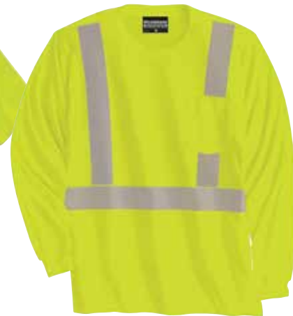
WearGuard® Class 2 High- Visibility Long-Sleeve T-Shirt