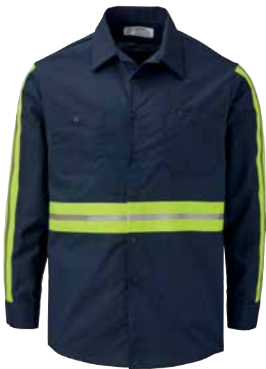
Aramark Enhanced Visibility Work Shirts 2909

Establish professionalism with your customers, improve employee morale and boost your brand identity with crisp uniforms