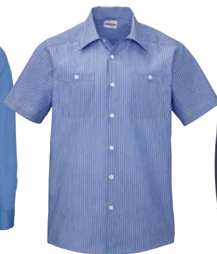
WearGuard® Short-Sleeve Deluxe Industrial Work Shirt 1023