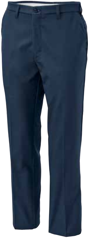
Aramark Authentic™ Men's Flat-Front Work Pants 201

Establish professionalism with your customers, improve employee morale and boost your brand identity with crisp uniforms