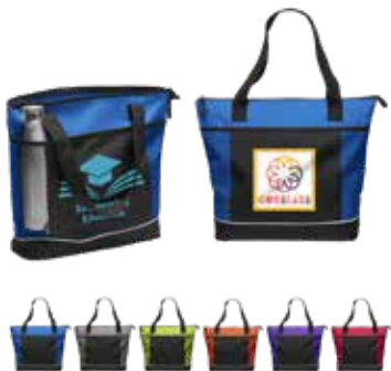
Porter Metro Tote LT-3973