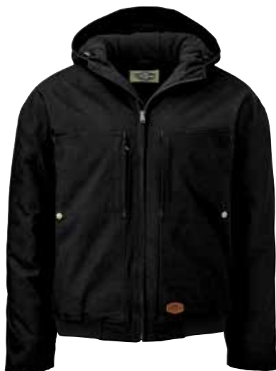
SteelGuard® Insulated Hooded Duck Jacket 3355