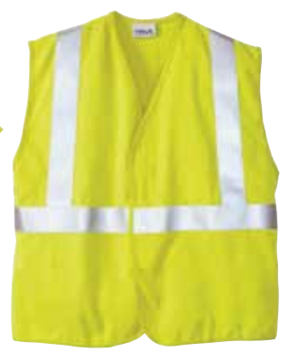
Class 2 High-Visibility FR Vest 5348