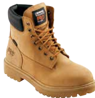
Timberland® Pro Series Men's Work Boot