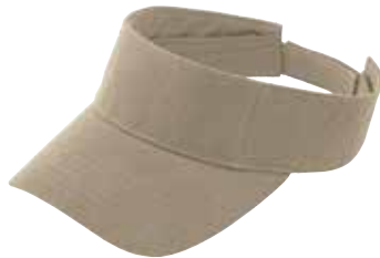
WearGuard® Lightweight Visor 1670