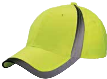
Enhanced-Visibility Cap 7112