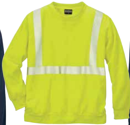
WearGuard® Class 2 High-Visibility Sweatshirt 2389