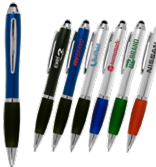
Ergo Stylus Pen PL-3928