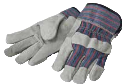
Leather-Palm Canvas Work Gloves