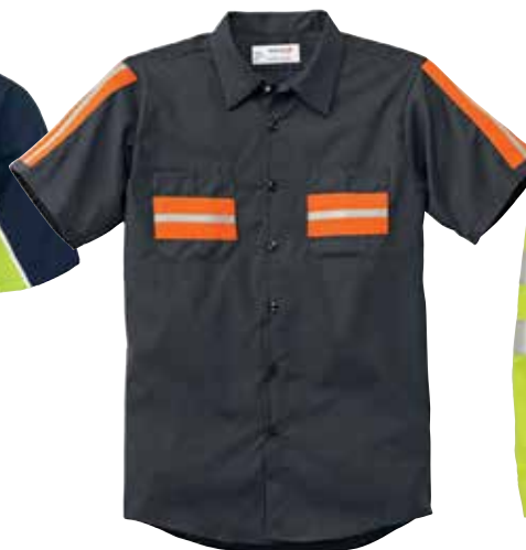
Aramark Enhanced-Visibility Short-Sleeve Charcoal Shirt 2891