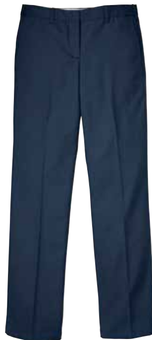
WearGuard® Women's WorkPro Flat Front Pants 2024