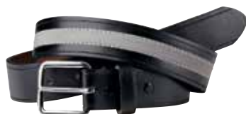
Leather Belt with Reflective