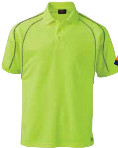
Enhanced Visibility Polo