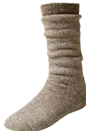
Wigwam® 40 Below Heavyweight Socks