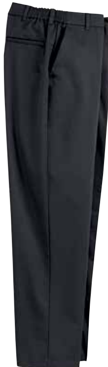
Aramark Side-Elastic Industrial Work Pants 292