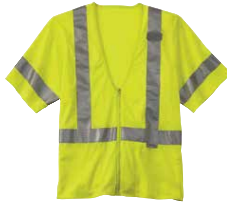
Class 3 Short-Sleeve High-Visibility Vest 11185