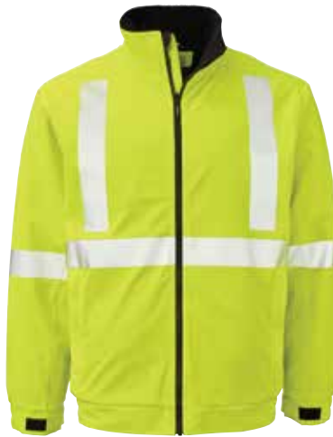
WearGuard® Class 2 Three-Season Jacket 420