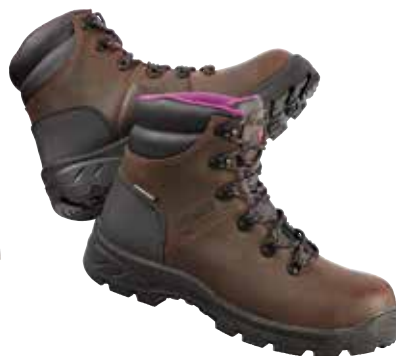
Avenger Women's Safety Toe Boot