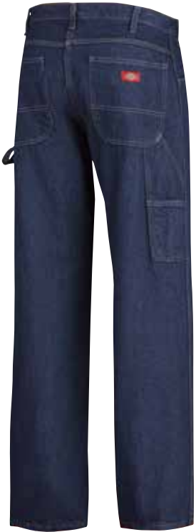
Dickies® Carpenter Jeans 2675

Establish professionalism with your customers, improve employee morale and boost your brand identity with crisp uniforms