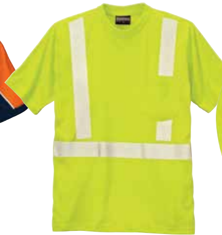
WearGuard® Class 2 High- Visibility Short-Sleeve T-Shirt