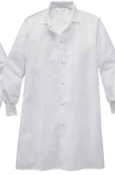
Aramark Knit-Cuff Poplin Lab Coat 3069