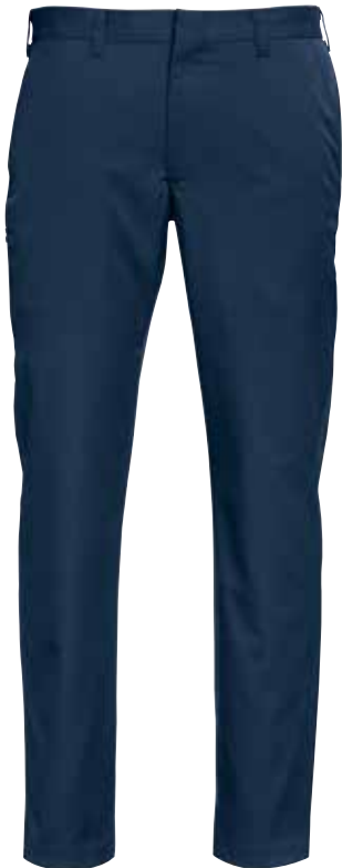
Aramark FlexFit™ Men's Performance Pant 21724