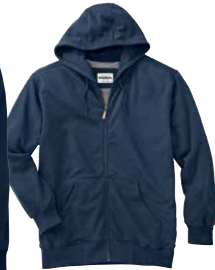
WearGuard® WearTuff™ Thermal-Lined Full-Zip Sweatshirt 194