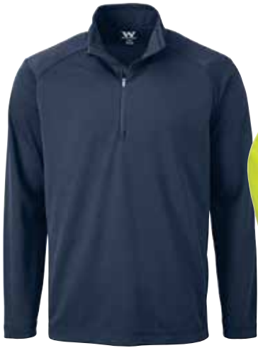
Executive Performance 1/4-Zip 25977

Establish professionalism with your customers, improve employee morale and boost your brand identity with crisp uniforms