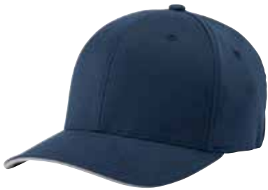
WearGuard® Cool & Dry Flexfit® Cap 6077