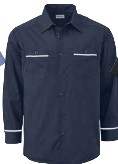
WearGuard® Enhanced- Visibility Long-Sleeve Premium Work Shirt 10226