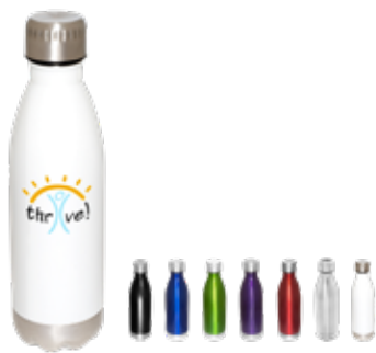
17 Oz. Vacuum Insulated Bottle PL-4671