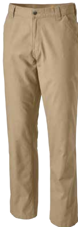
Carhartt® Men's Rugged Flex® Canvas Work Pant 10500