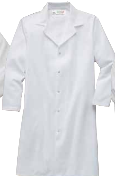
Aramark Men's Pocketless Snap-Front Lab Coat 3068