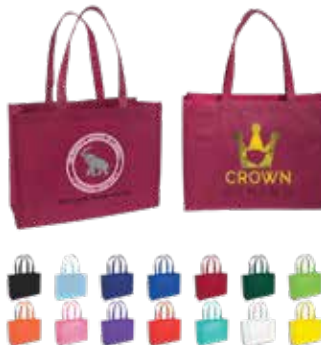
Standard Non-Woven Tote BG108