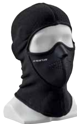
Seirus® Neofleece Balaclava 7074