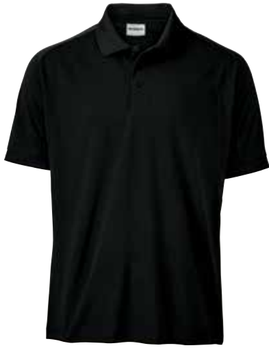
WearGuard® Men's Premium Performance Piqué Polo

Establish professionalism with your customers, improve employee morale and boost your brand identity with crisp uniforms