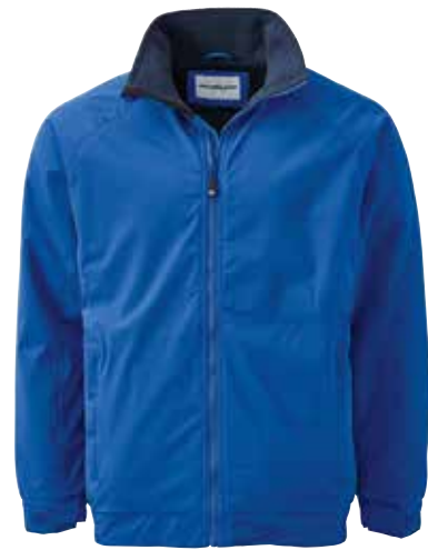
WearGuard® Pro-Fit Three-Season Jacket 82401