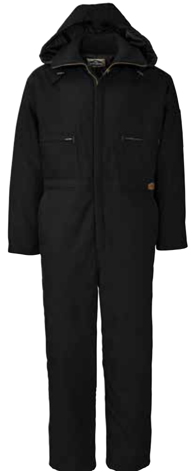
SteelGuard® 30° Below Insulated Coveralls 3359