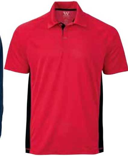
WearGuard® Performance Color Block Polo