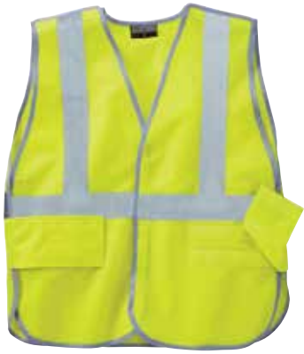
WearGuard® Class 2 High-Visibility Breakaway Vest 10741