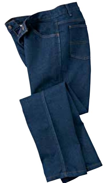
Aramark Women's 5-Pocket Jeans 21039