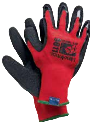
HexArmor® Coated Gloves