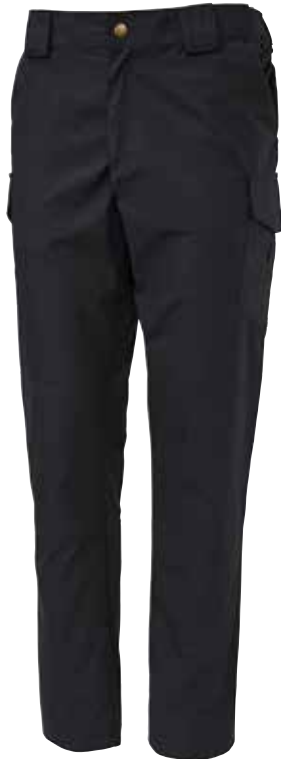
Tact Squad Tactical Pants 8439