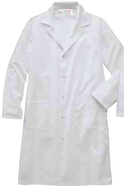
Aramark Snap-Front Lab Coat 3066

Establish professionalism with your customers, improve employee morale and boost your brand identity with crisp uniforms