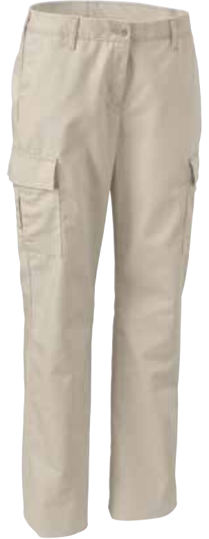
Aramark Women's Cargo Work Pants 2529