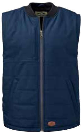
SteelGuard® Quilted Vest 3353