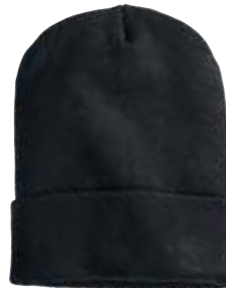
WearGuard® Knit Hat With Thinsulate™ 1984